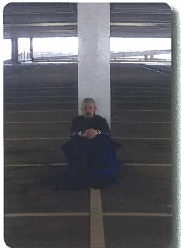
The 2015 Sleepout will take place in the car park of Union Square shopping centre

The Sleepout will return on Monday 26th October